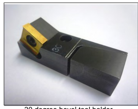
30 degree bevel tool holder